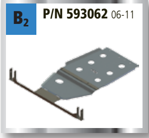
Gear/Transfer skid plate