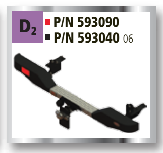
■ HDN rear tow bumper