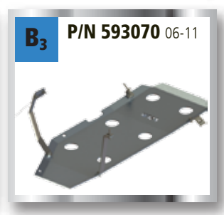
Fuel tank skid plate