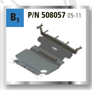
Front skid plate