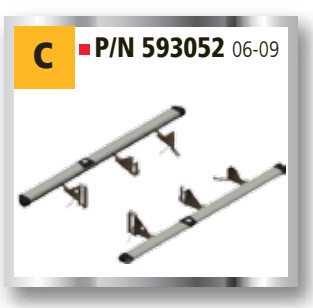
Side protectors / steps