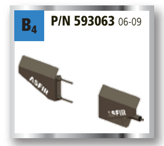
Rear axle ABC cable protector