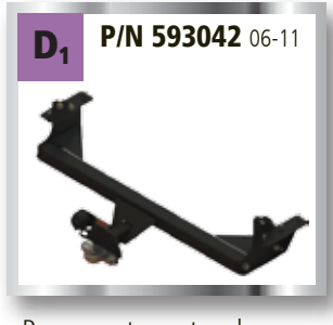
Permanent rear tow bar